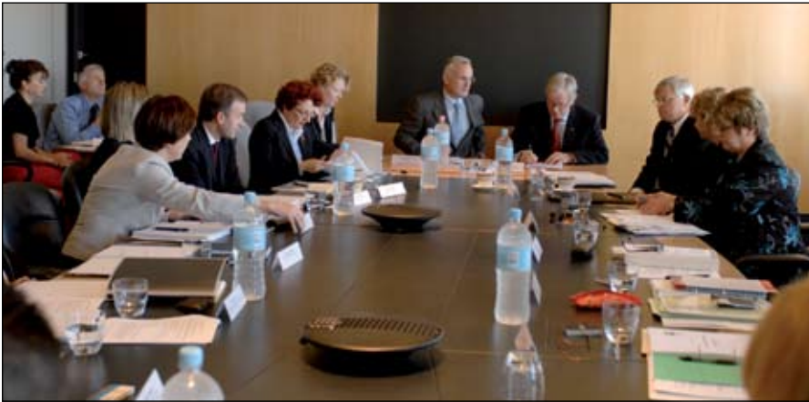
NQC Meeting in progress.